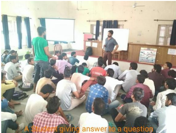
A Student giving answer to a question