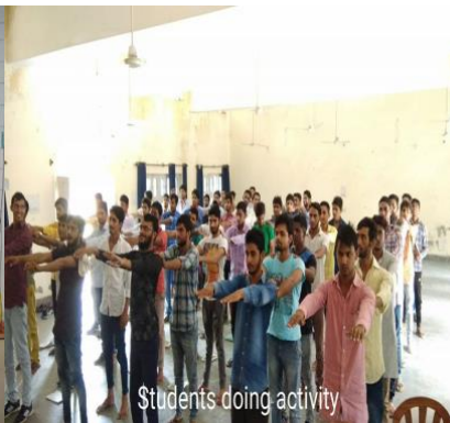
Students doing activity