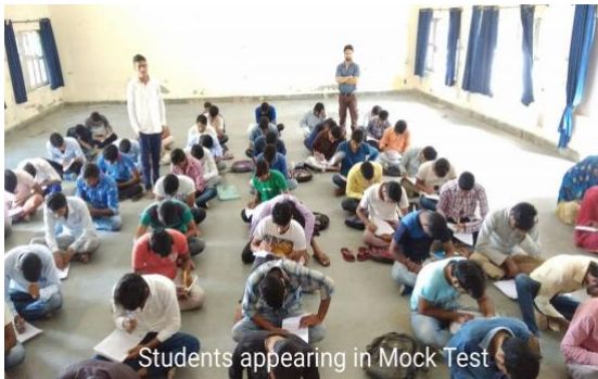
Students appearing in Mock Test