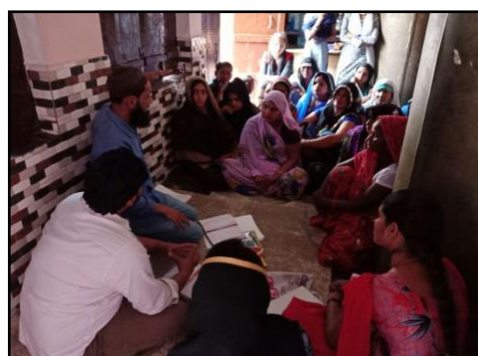
Table 2: Area wise meetings organized by the mentors